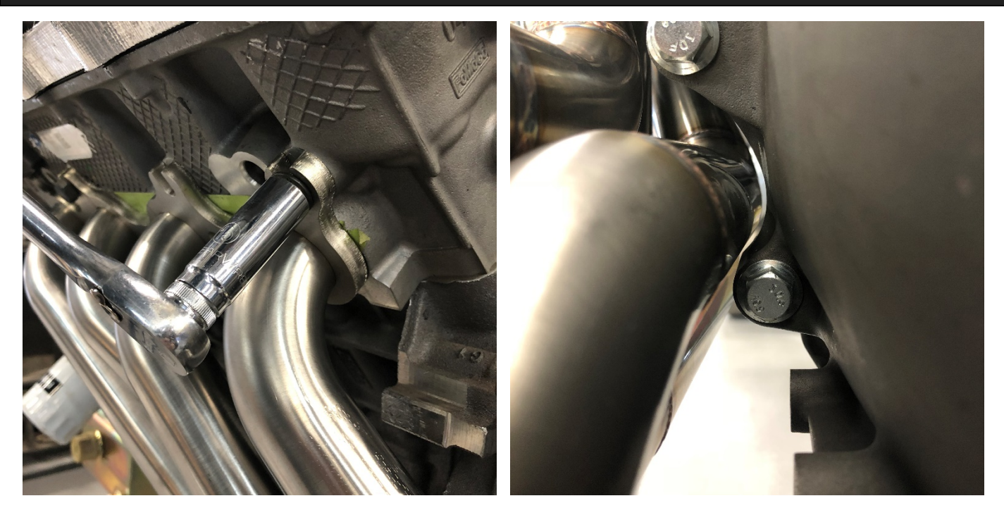
The header can now be temporarily secured and checked to confirm there is space between the innermost tube and the engine and transmission.