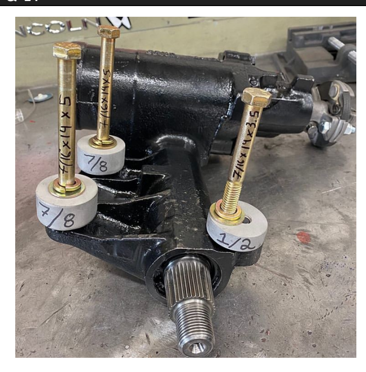
1961-64 Models Only: These models will require an upgrade to the 1965-69 model steering box which is smaller and allows clearance to the headers. A steering box retrofit kit is Included with the 1961-64 option.