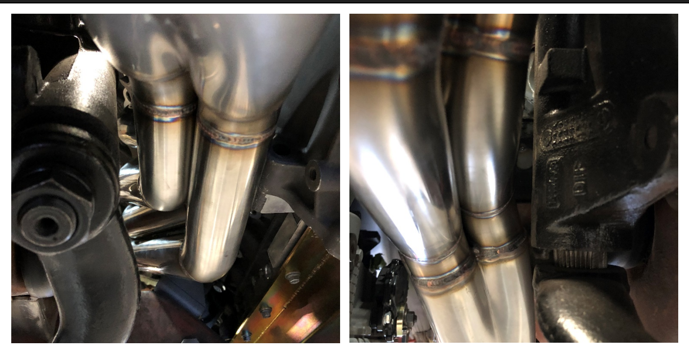
With the engine in place, it is advised to confirm the space between the header and the steering box which should be a minimum of ¼ inch to ½ inch clearance in all places.