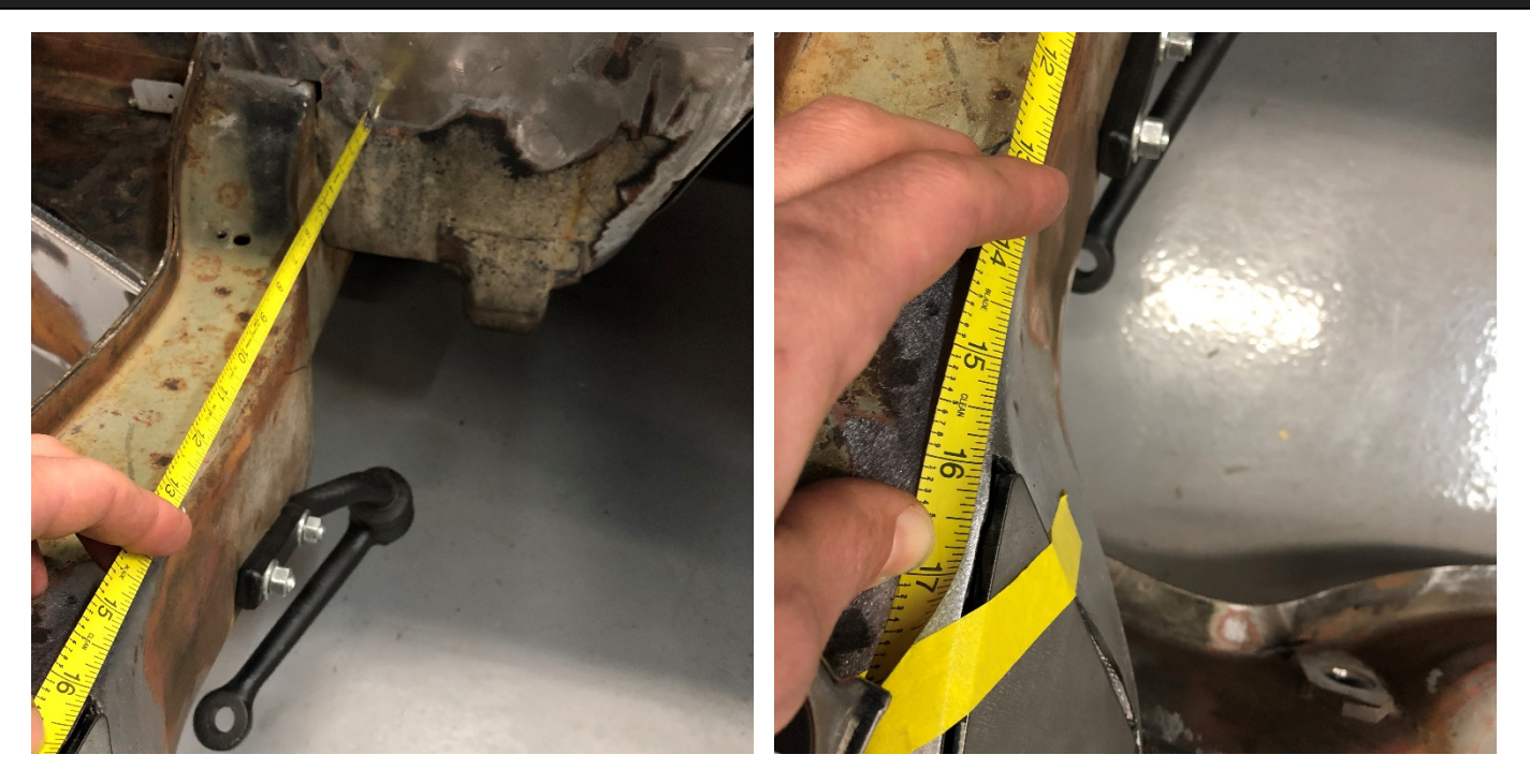
A small patch is required on the passenger side to install the headers. Measuring from the firewall, the back corner of the included patch plate will fit at 16 inches.