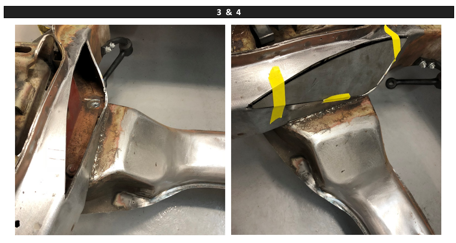
Picture 3 shows the shape that should be removed with a cut-off wheel or similar. It is advised to make multiple trims until the patch part fits as shown. The patch part can be taped into place so that the engine can be installed and clearance verified before any welding is done.