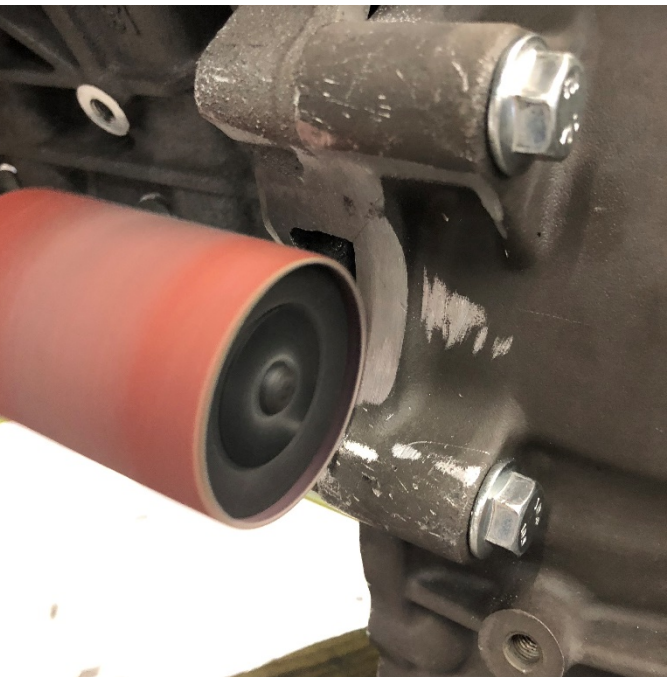
By holding the driver side header in place, it can be seen that the inside tube contacts the engine block and transmission bellhousing. This area should be sanded as shown using a drum sander or similar tool.